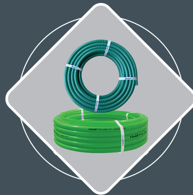
GARDEN & SUCTION HOSE