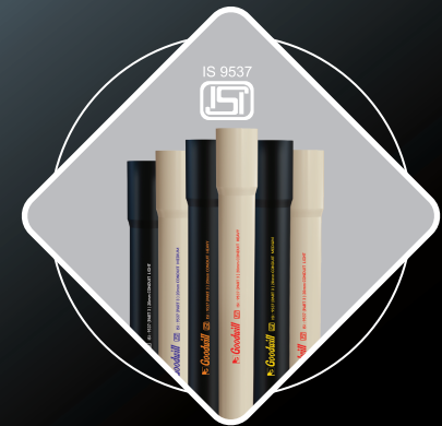
CONDUIT PIPES & FITTINGS